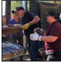
Cleanup at the Community Center