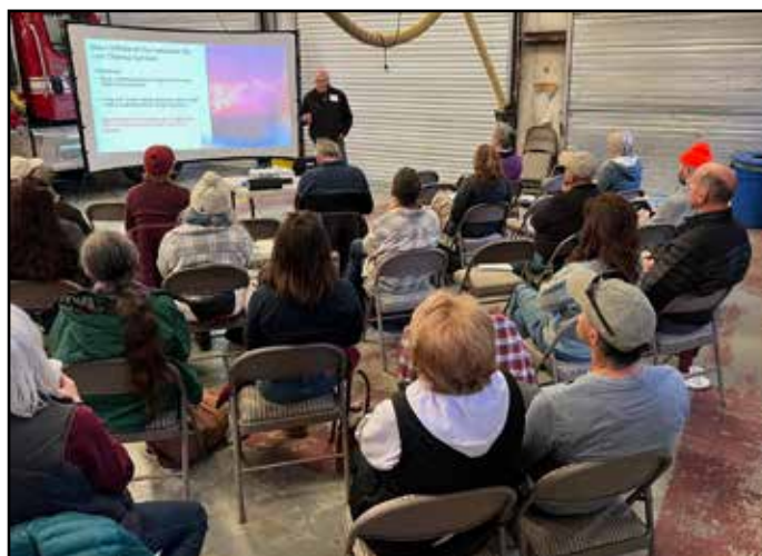
Last Chance Survival Simulation Workshop