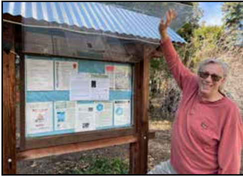
Community Information Board