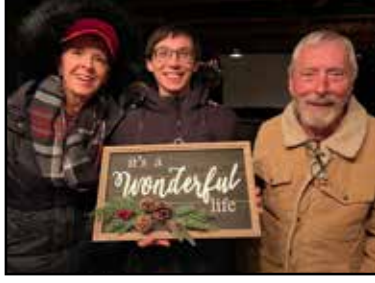
Movie Night at Bailey's Lodge "It's A Wonderful Life" December 10, 2022