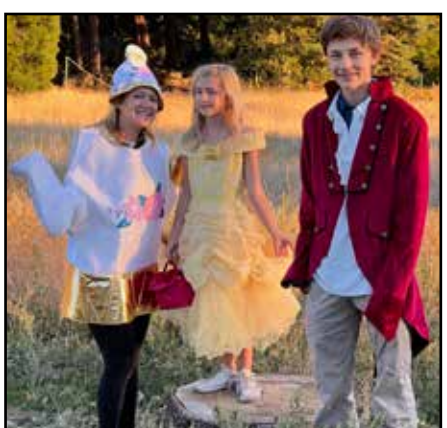
Halloween 2022 Across from Palomar Mountain Lodge