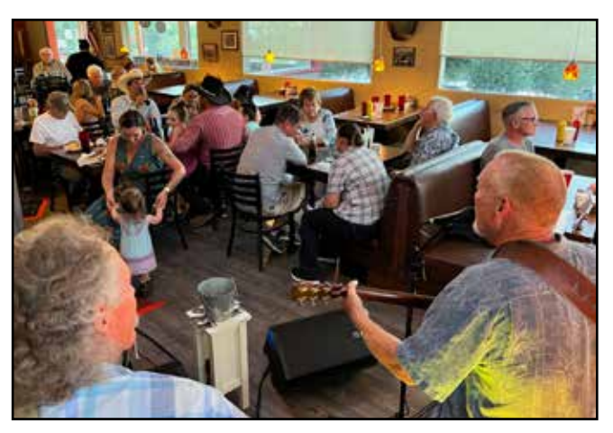
Smith Mountain Boys at Lake Henshaw Cafe - August 2022