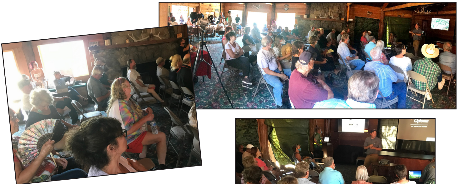
The Community Safety Presentation at the Lodge was well attended.