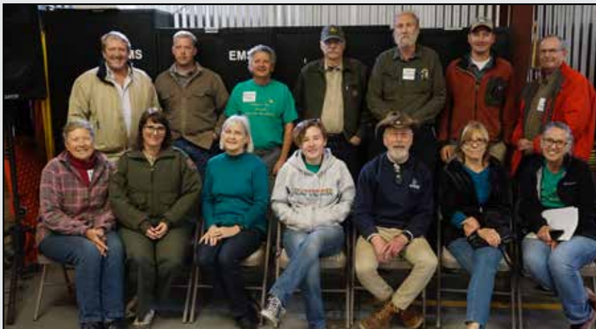
2018-2019 Board of Directors

Please take a minute to thank them for all of the time and effort they put into serving this vital organization.