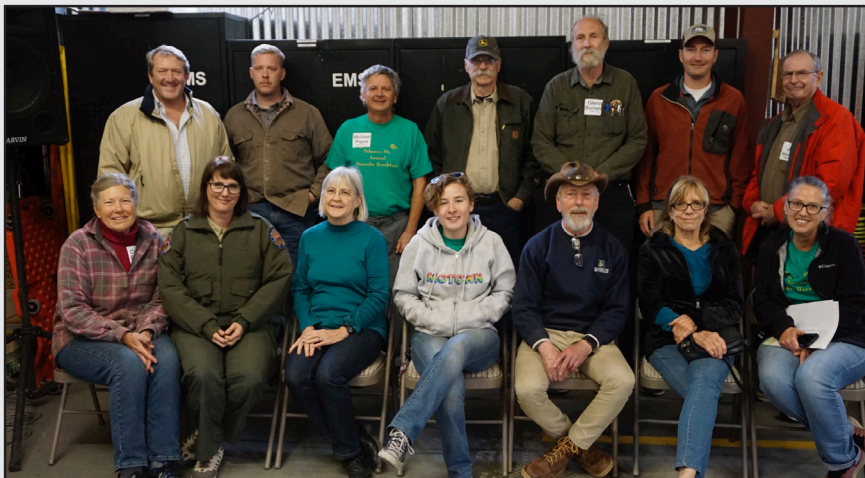
2018-2019 Board of Directors

Please take a minute to thank them for all of the time and effort they put into serving this vital organization.