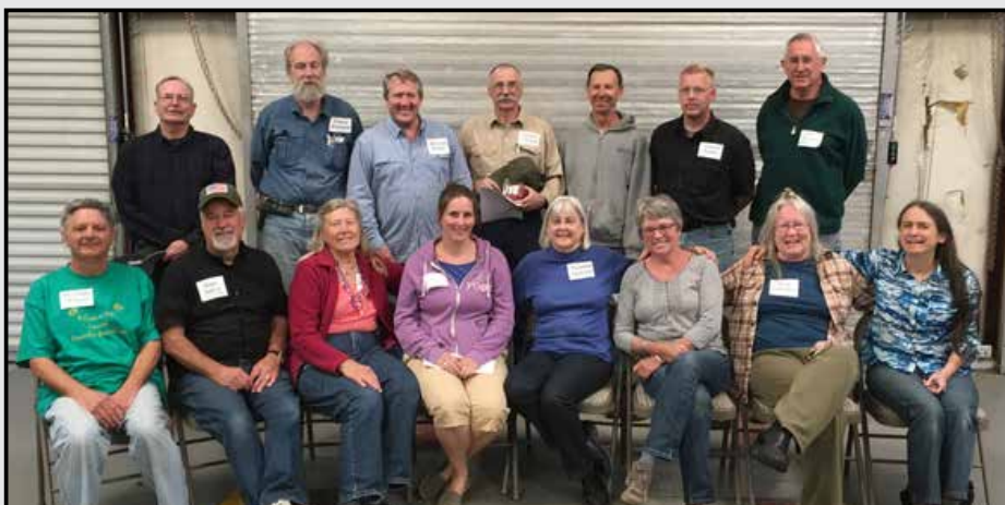
2017-2018 Board of Directors

Please take a minute to thank them for all of the time and effort they put into serving this vital organization.